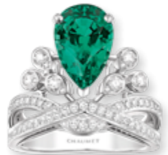
Joséphine "Aigrette impériale" ring