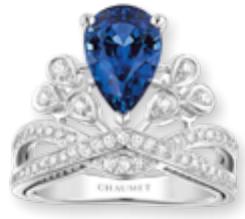
Joséphine "Aigrette impériale" ring