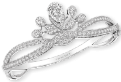
Joséphine "Aigrette impériale" bracelet