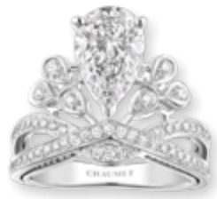
Joséphine "Aigrette impériale" ring