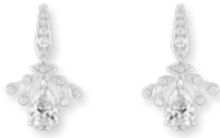
Joséphine "Aigrette impériale" earrings