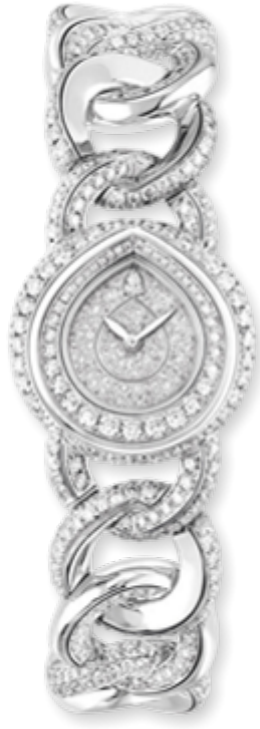
Joséphine "Rondes de nuit" watch Small Model