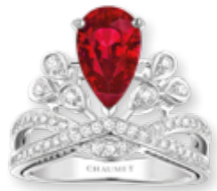
Joséphine "Aigrette impériale" ring