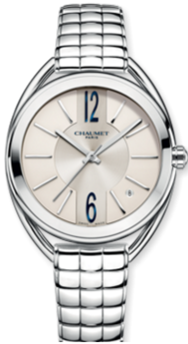
Liens watch Medium Model