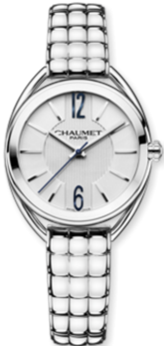
Liens watch Small Model •