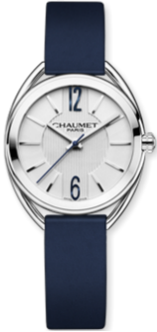
Liens watch Small Model •