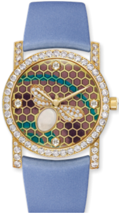
Attrape-moi... si tu m'aimes watch Large Model