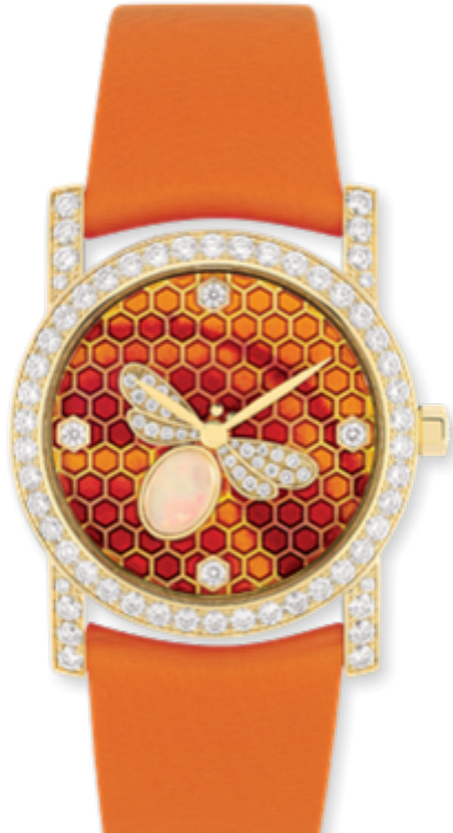
Attrape-moi... si tu m'aimes watch Large Model