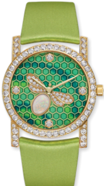
Attrape-moi... si tu m'aimes watch Large Model