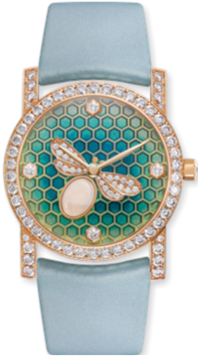
Attrape-moi... si tu m'aimes watch Large Model