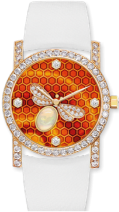
Attrape-moi... si tu m'aimes watch Large Model