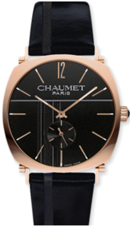
Dandy watch Large Model